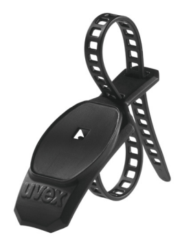
uvex camera adapter $41,9,776,0200

fits models: uvex airwing, uvexi-vo, uvex kid 2